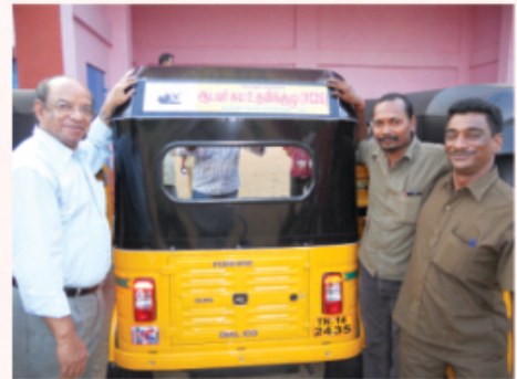
Proud owners of a brand new auto with the MCDS Director. Don't miss the sticker!