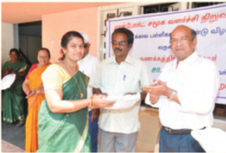
A token of appreciation to the staff