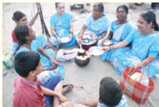
All set to share

In the beginning, the Earth's atmosphere contained very little oxygen (less than 1% oxygen pressure)