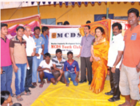
Exciting days ahead for the youth