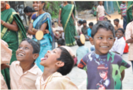
Too smart to be working

Here are some interesting photographs of the event.