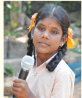
Sharing her experience