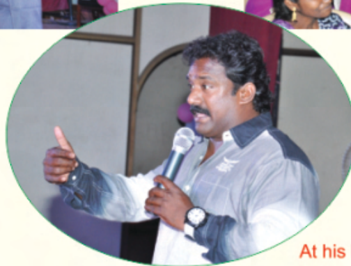
At his best