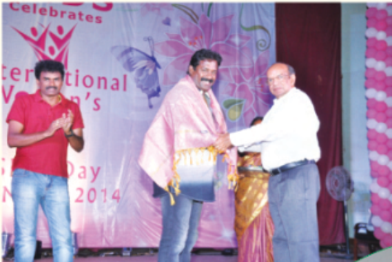
Robo Shankar being welcomed

Robo Shankar, the entertainer par excellence spent quality time mesmerising with songs, dance and a variety that he is known for. Robo Shankar is today right on top in the realm of film and television entertainment.