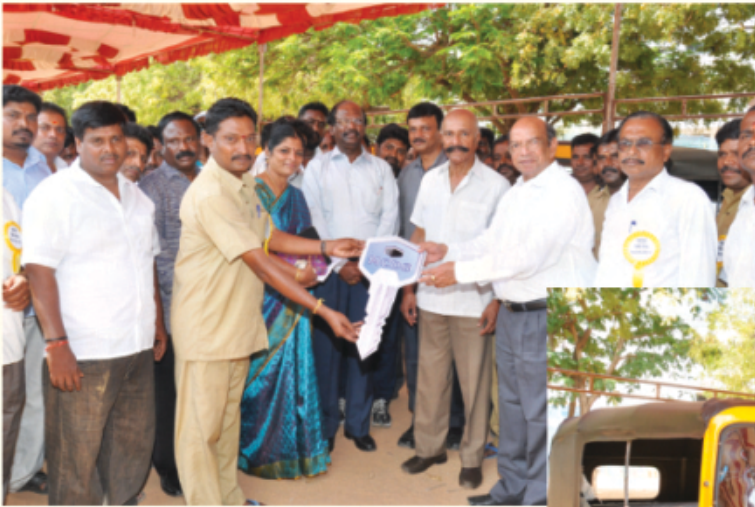
The symbolic key to the Autos being handed over