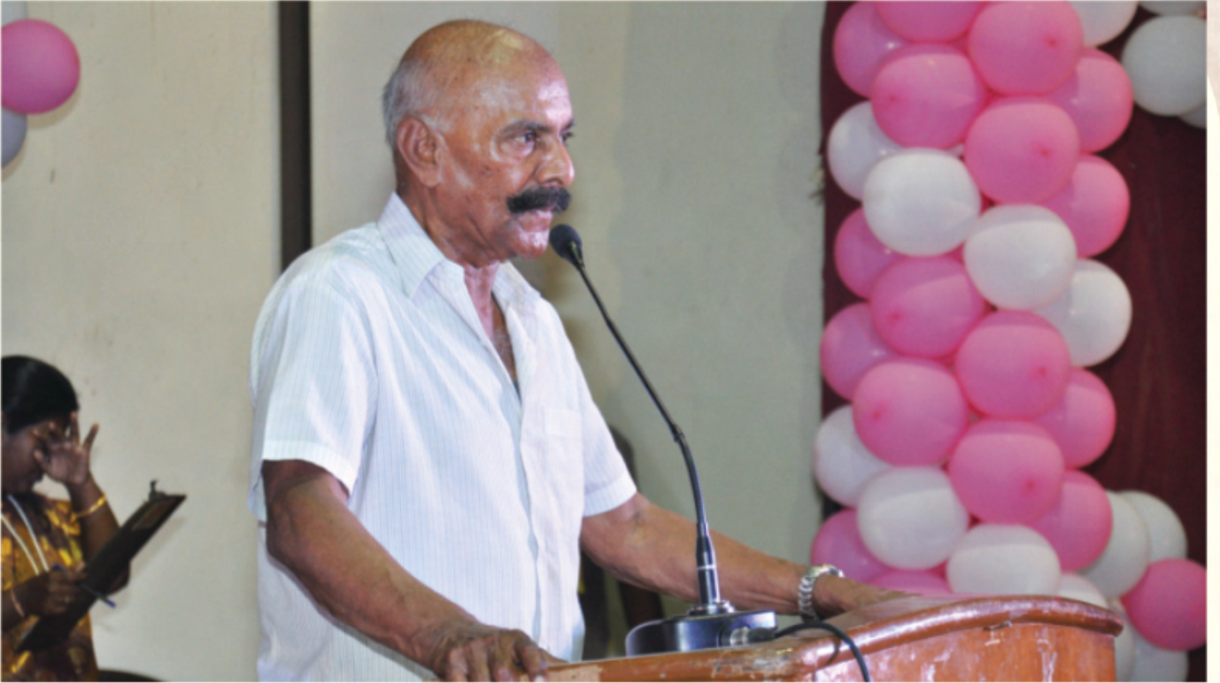
The Chief Guest addressing the gathering