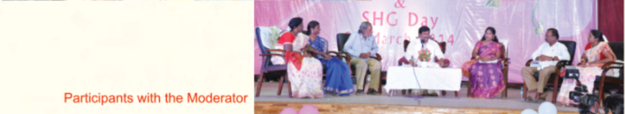
Participants with the Moderator

When you plant a tree, never plant only one. Plant 3 - one for shade, one for fruit, one for beauty - African Proverb