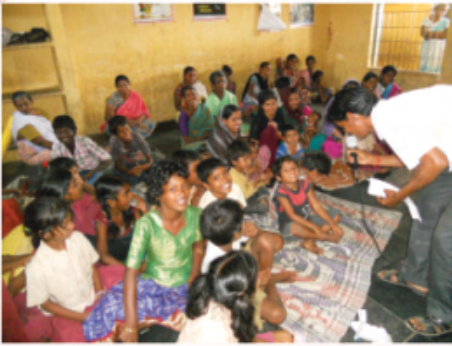
A Child Rights Protection Forum, at a session