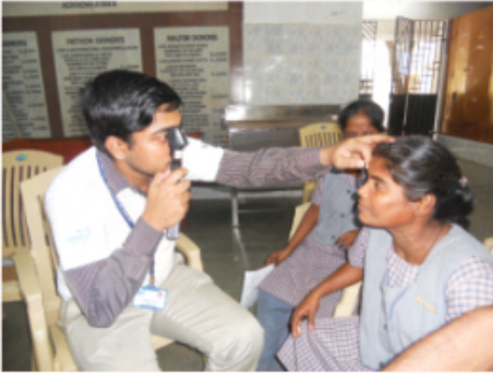
An Eye camp for our Special Children