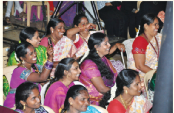
Enjoying every bit of it