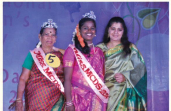
The winners with the chief guest