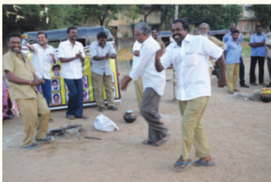
Men SHGs too at the celebrations