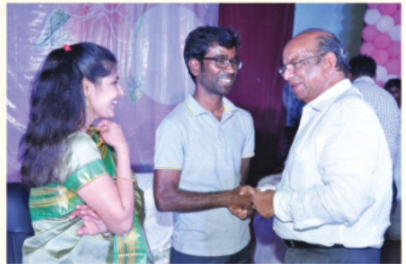
A word of thanks from the Director, MCDS