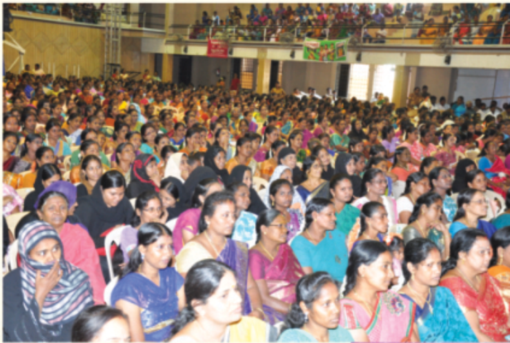
3000 and counting