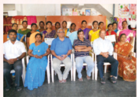
Yet another batch at the conclusion of a Tailoring session with sponsoring Rotarians and MCDS staff

Computers pose an environmental threat because much of the material that makes them up is hazardous. A typical monitor contains 4-5 pounds of lead.