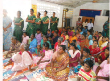
Parents of our 'Transit School' children