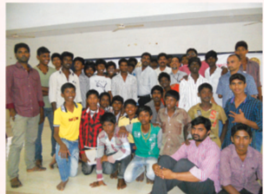
The Campers with the staff

1 out of 4 ingredients in our medicine is from rainforest plants.