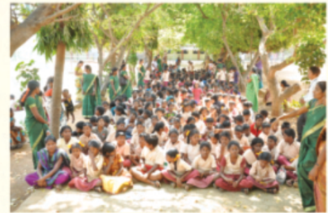
They should be in school and not at work