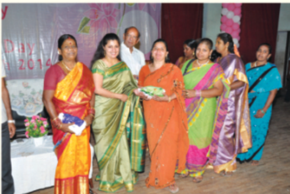
Winners of the Dance Competition