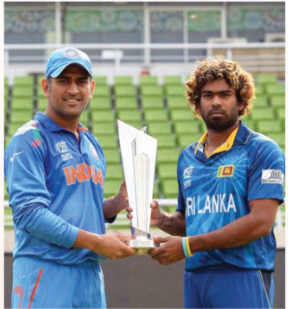
The Best ( right ) & the second Best

Come the IPL, and all this will be forgotten. And all the players (performers) will laugh all their way to the bank.