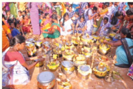
It is pooja time