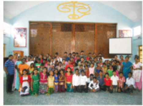
Our children at Arul Kadal for Pongal Celebrations