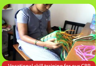
Vocational skill training for our CBR Youth