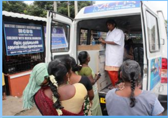
Our Ambulance Mobile Clinic on Wheels with Doctor, Nurse and free medicines