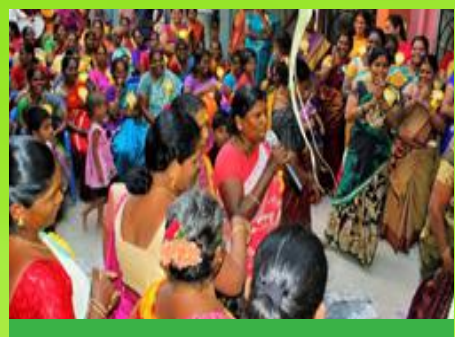
Pongal Celebrations at Federation level

Total Number of SHG members – 1820 Women