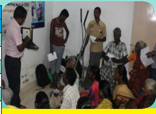
TB Awareness and Screening by REACH for our SHG groups