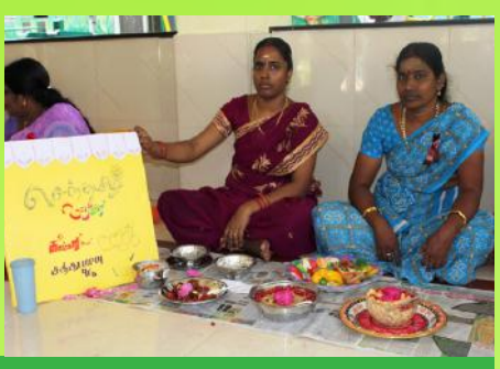
Cooking without fire – a competition by one of the Federation for all their groups