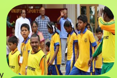
Unified Sports Meet at Monfort School, St. Thomas Mount