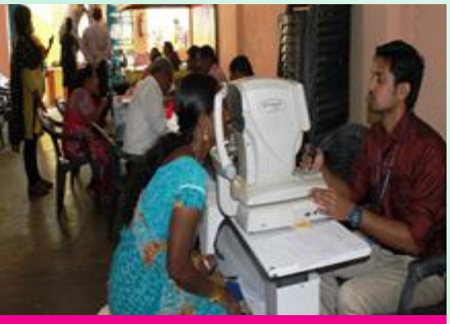
Eye Screening in collaboration with India Vision Institute & Sankara Nethralaya