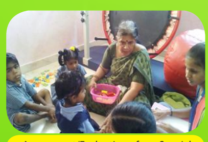
Assessment/Evaluation of our Special Children in Chemmancherry by Resource Person from Vidya Sagar

MCDS started with One CBR centre in the slums of Srinivasapuram. After the Tsunami, the slum dwellers were relocated in Kannagi Nagar and Chemmencherry. The Tamil Nadu Slum Clearance Board made a request to MCDS to start a centre each in these two relocated areas. It is after the Chennai Floods '2015' that a further request was made to start one more centre at Perumbakkam. Thus we have Four CBR centres in the slums and slum relocated areas. The Four centres now have been divided into two groups, considering their age factor. The centres at Srinivasapuram and Perumbakkam are meant for those above sixteen years of age. They are given Vocational training to make them independent. The other two centres at Kannagi Nagar and Chemmencherry cater to those below sixteen years. They are given systematic training to look after their own needs and become independent. The mildly affected ones among them are given training to admit them in normal schools and thereby mainstream them. They are also given Physiotherapy by a qualified Physiotherapist.