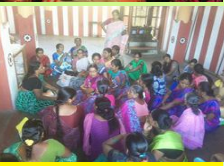
Monthly meeting of all members of Federation