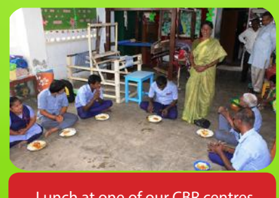
Lunch at one of our CBR centres