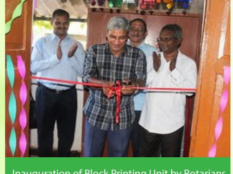
Inauguration of Block Printing Unit by Rotarians