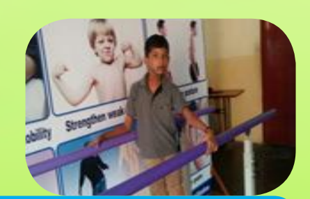
Our Special Children availing Therapy Equipment facility

MCDS started with One CBR centre in the slums of Srinivasapuram. After the Tsunami, the slum dwellers were relocated in Kannagi Nagar and Chemmencherry. The Tamil Nadu Slum Clearance Board made a request to MCDS to start a centre each in these two relocated areas. It is after the Chennai Floods '2015' that a further request was made to start one more centre at Perumbakkam. Thus we have Four CBR centres in the slums and slum relocated areas. The Four centres now have been divided into two groups, considering their age factor. The centres at Srinivasapuram and Perumbakkam are meant for those above sixteen years of age. They are given Vocational training to make them independent. The other two centres at Kannagi Nagar and Chemmencherry cater to those below sixteen years. They are given systematic training to look after their own needs and become independent. The mildly affected ones among them are given training to admit them in normal schools and thereby mainstream them. They are also given Physiotherapy by a qualified Physiotherapist.